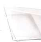
PVC Transparent Sheet