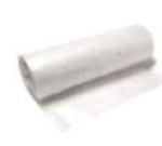
Clear Plastic Sheet